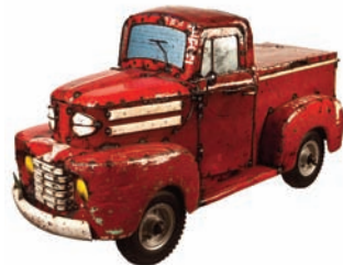
Cheeky Bee Candle Co. & Gallery