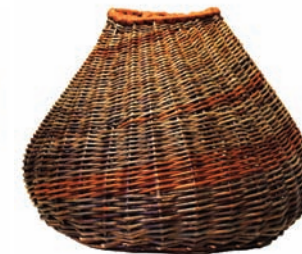
The Branch Ranch