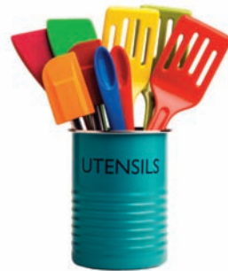
The Village Pantry