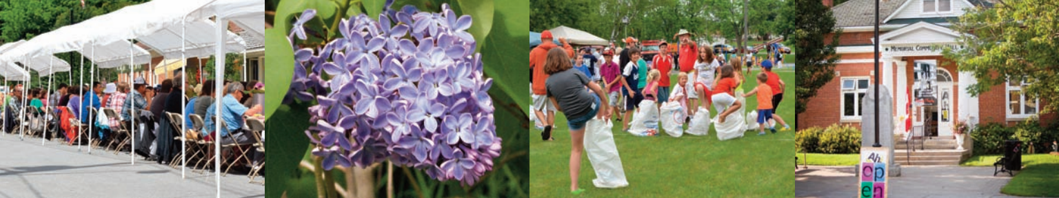
Long Lunch Lilac Festival Canada Day Ah! Arts and Heritage Centre