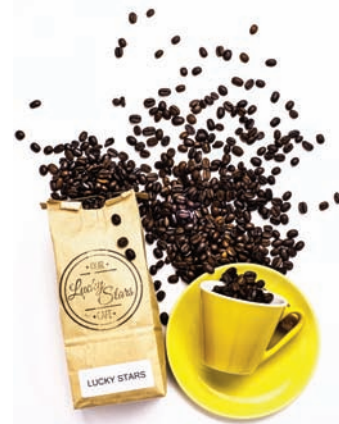
Our Lucky Stars