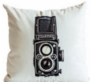
WeeDog Wearable Art