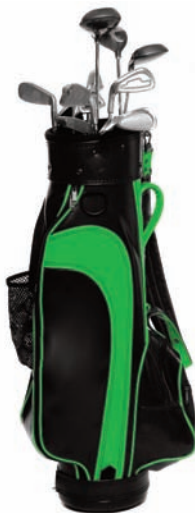
Salt Creek Golf Links