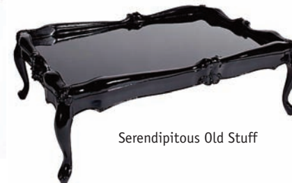
Serendipitous Old Stuff