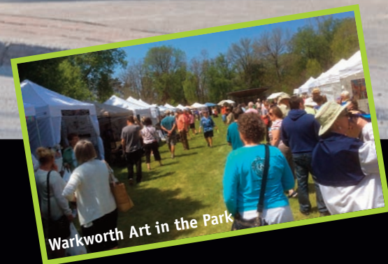
Warkworth Art in the Park

Guide published by the Tourism Committee of the Warkworth Business Association © 2017