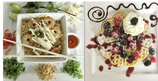
Serendipitous Old Stuff