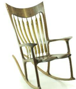
Cheeky Bee Candle Co. & Gallery

Arts and Heritage Centre of Warkworth Celebrates our vibrant local arts community and heritage. 35 Church St. ahcentre.ca