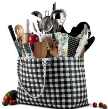
The Village Pantry