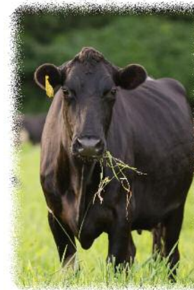
Roaming Valley Farm