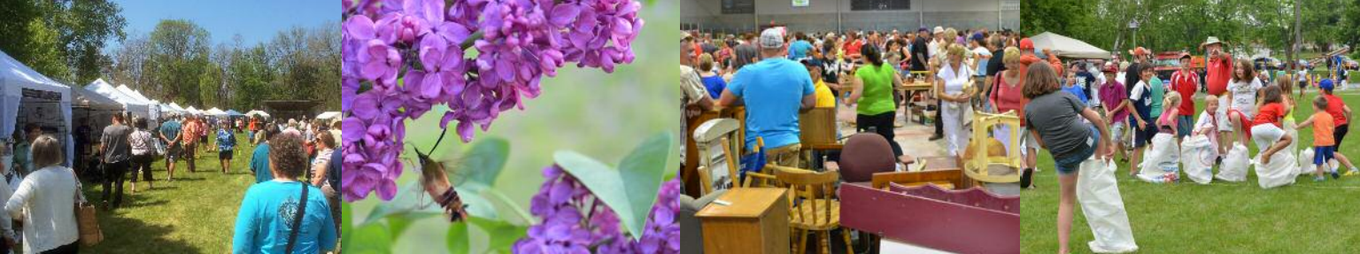
Art in the Park