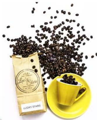
Our Lucky Stars