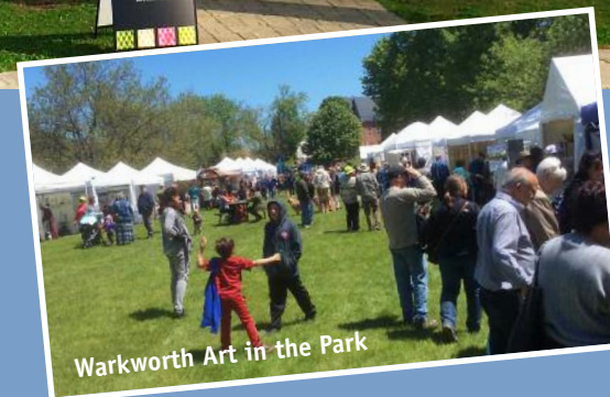
Warkworth Art in the Park